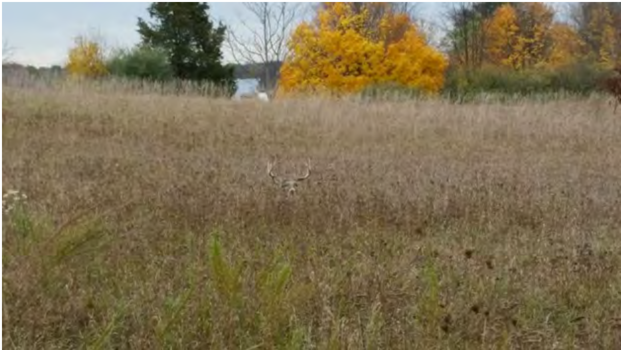
Figure 6. Deer peering above a well maintained grass field and wildlife corridor at Elcona Country Club, Bristol, IN.