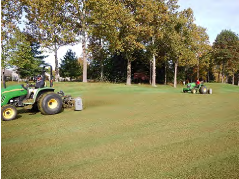
Figure 16. Verticutting operation on a fairway.