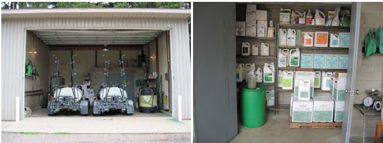
Figure 5. Separate building for storing, mixing and loading plant protectants complete with metal shelving for chemicals in a locked, limited access area, at Elcona Country Club.