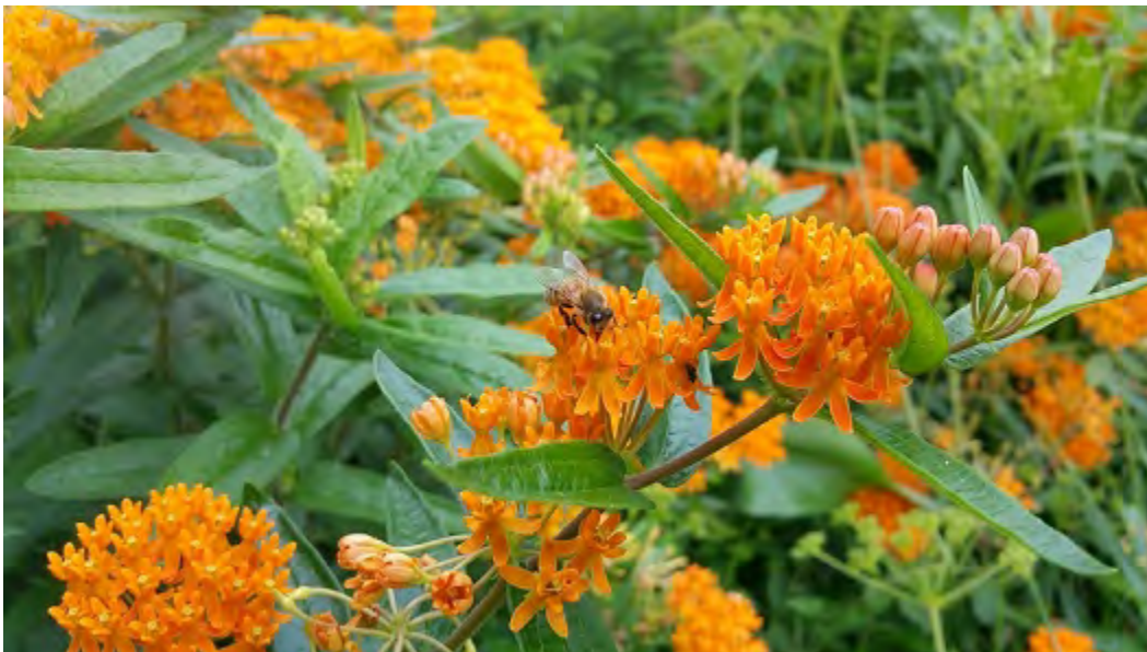
Figure 17. A bee on butterfly weed.