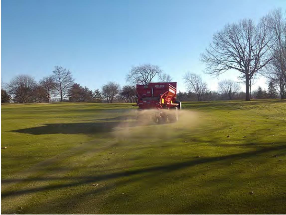
Figure 15. Light sand topdressing on a fairway.