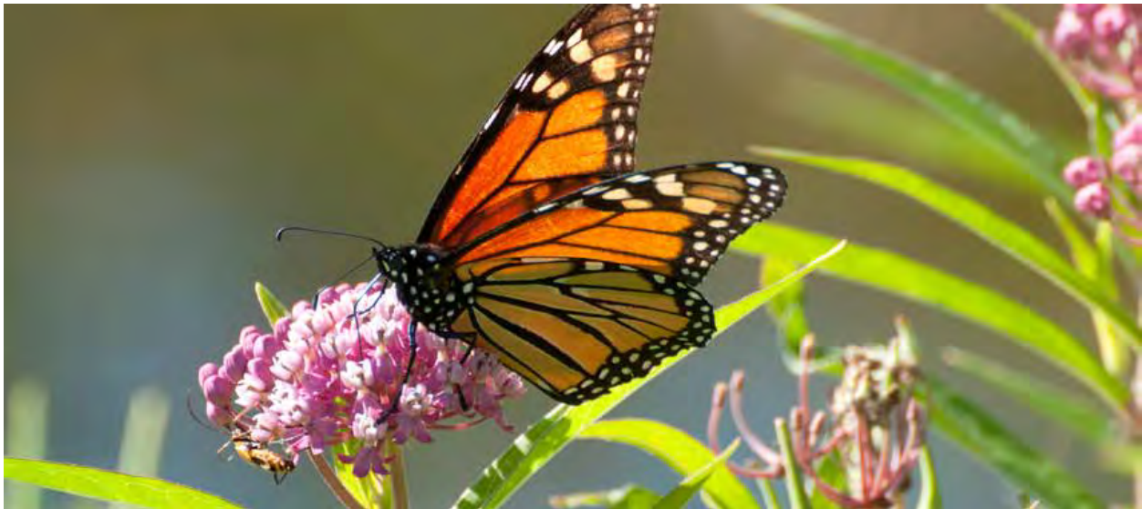
Figure 19. Monarch butterfly in a landscape.