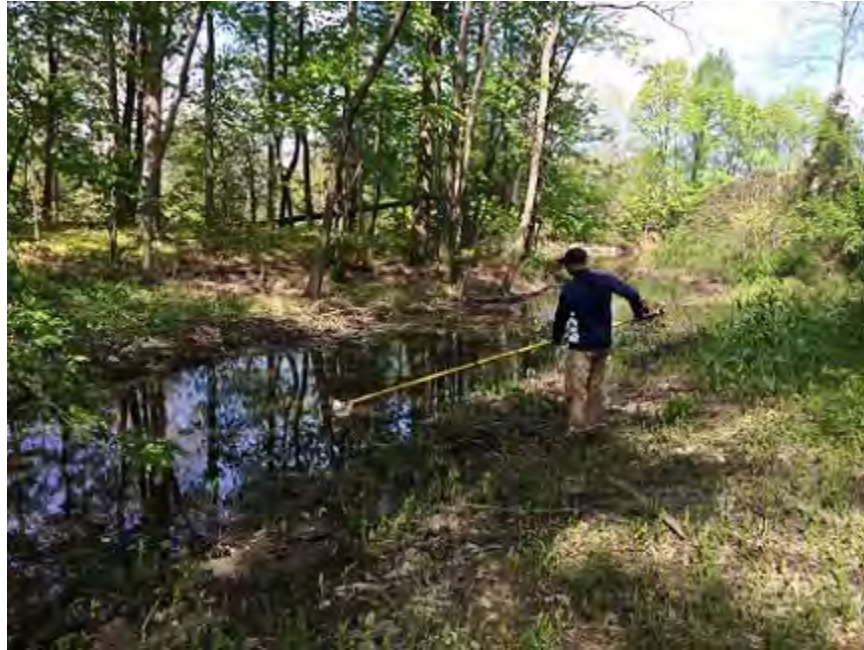
Figure 12. Collecting samples of a water body.