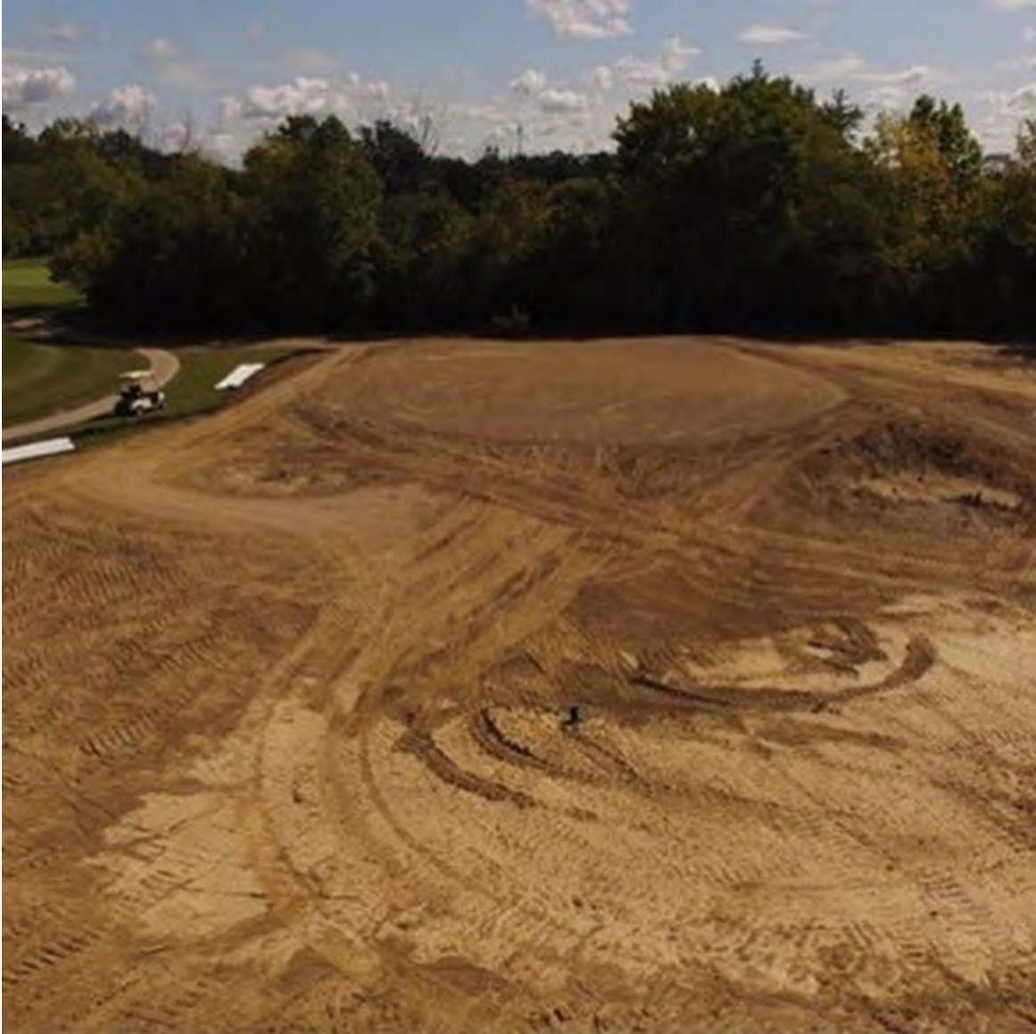
Figure 2. Construction and shaping of a green complex at Cross Creek Golf Club, Decatur, IN.