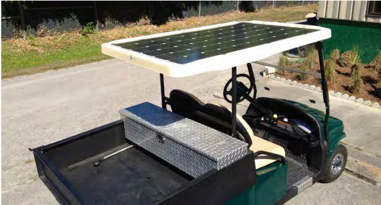
Figure 23. Use of solar panels to power a utility cart.