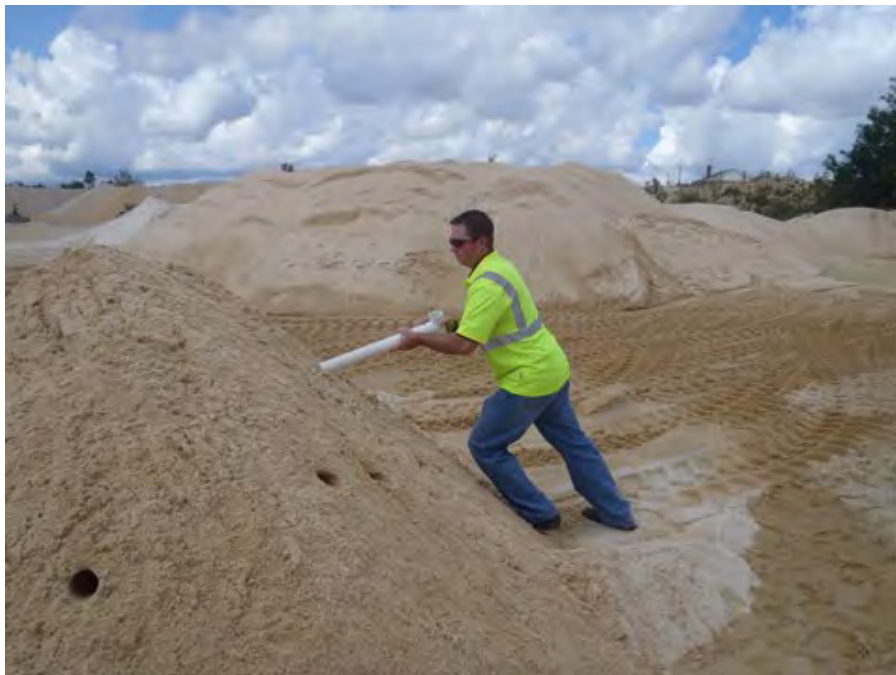
Figure 1. Collecting sand samples for particle analysis.