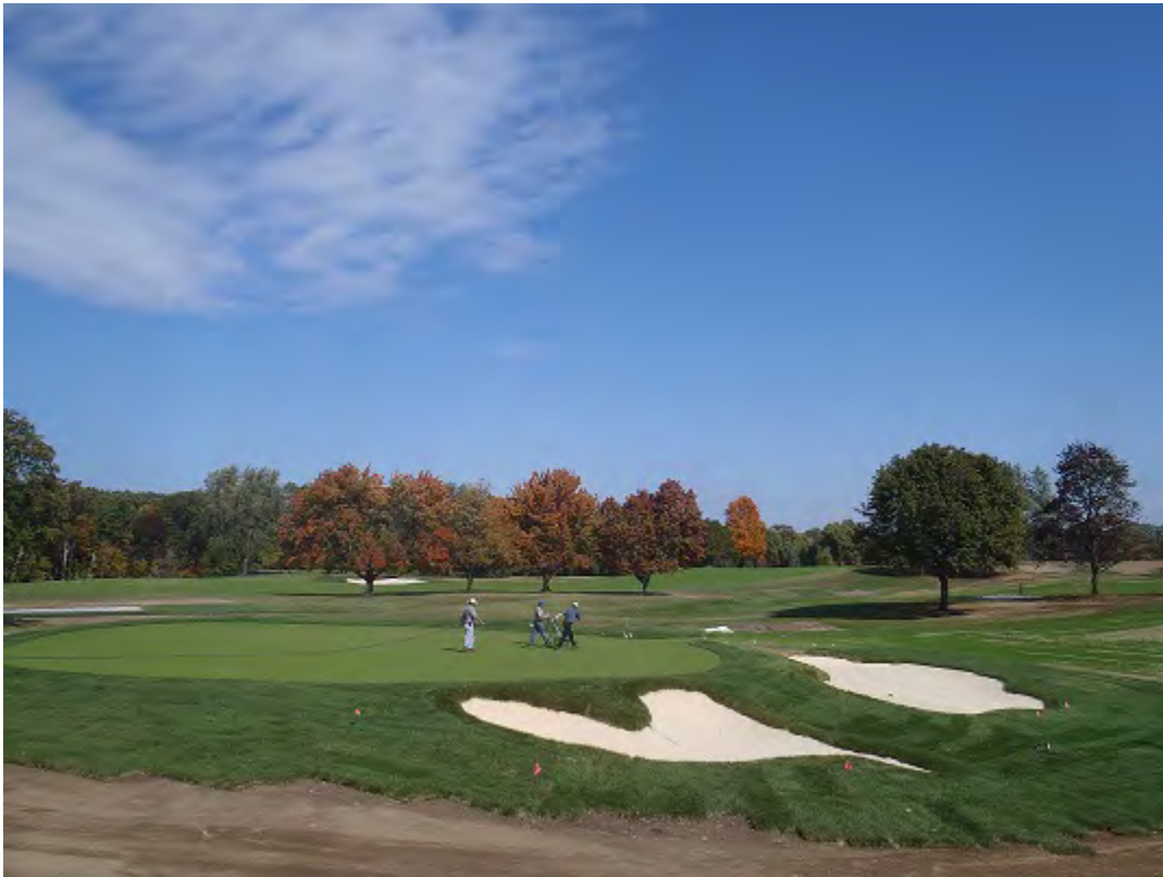
Figure 3. Nutrients applied to a new green complex.