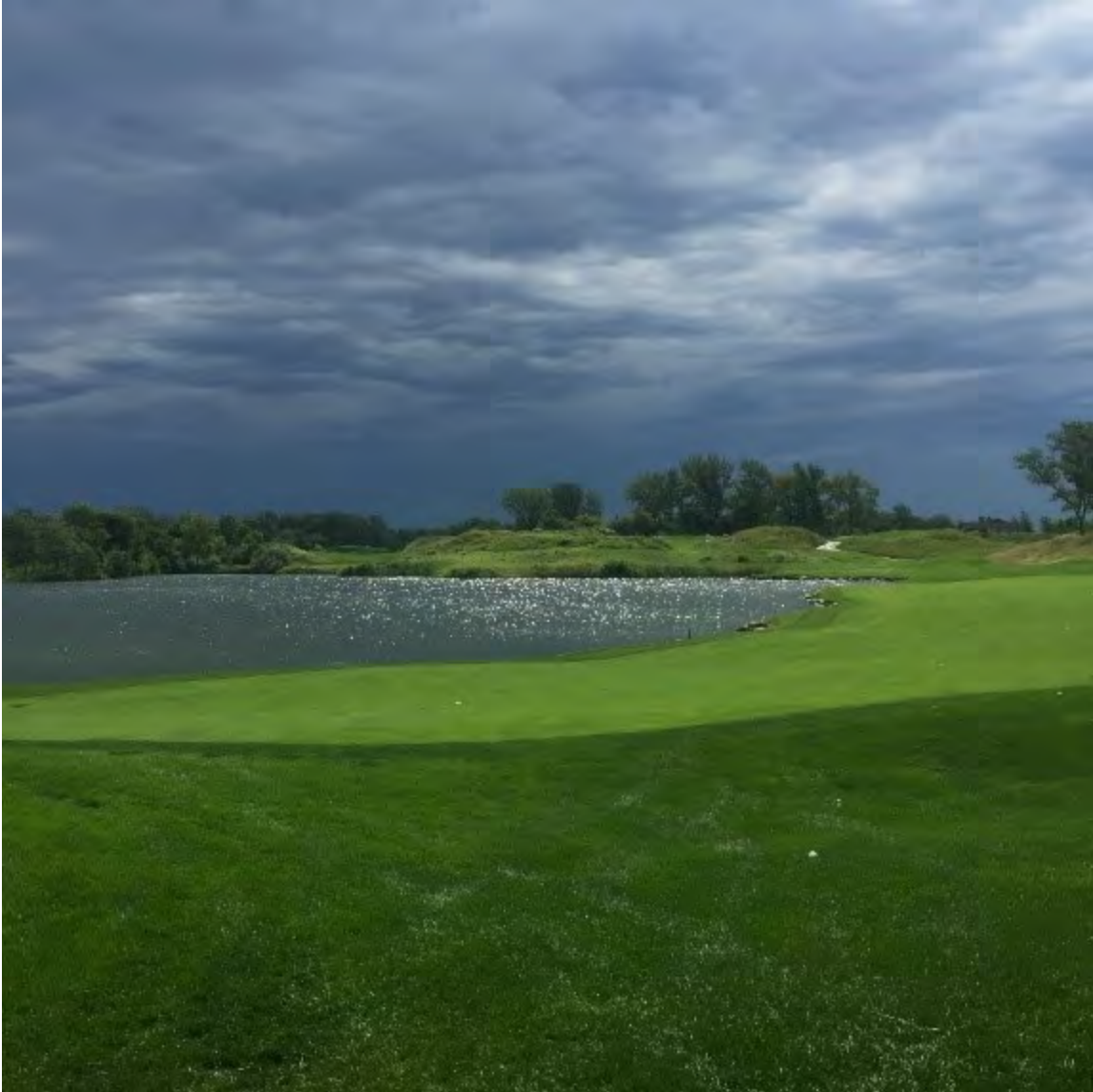
Figure 4. Pond at Victoria National Golf Club.