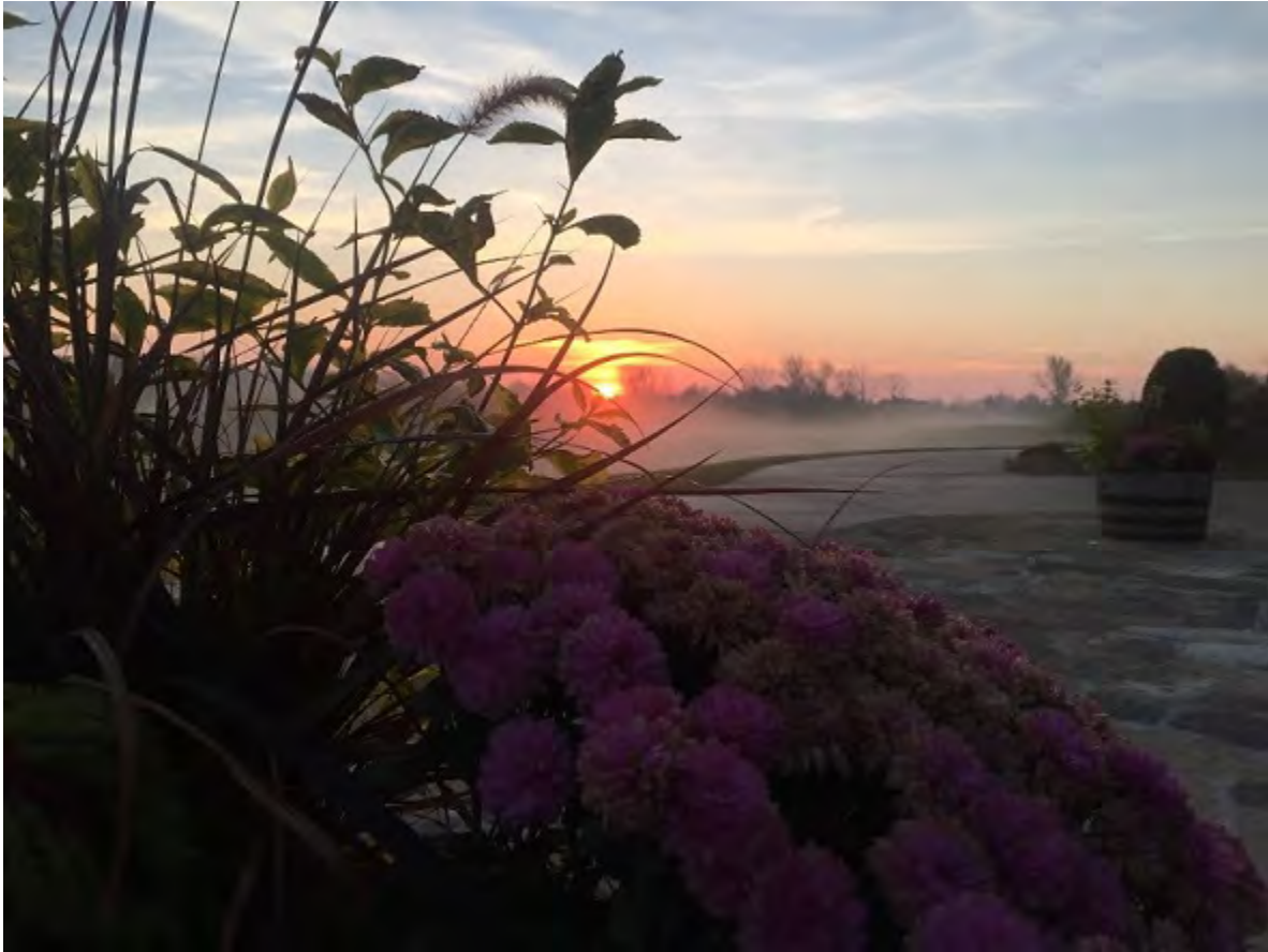
Figure 20. Pollinator plantings along a tee area at Victoria National Golf Club.

native trees, shrubs, and herbaceous vegetation to provide wildlife habitat in non-play areas, along water sources to support fish and other water-dependent species. By leaving dead trees (snags) where they do not pose a hazard, a well-developed understory (brush and young trees), and native grasses, the amount of work needed to prepare a course is reduced while habitat for wildlife survival is maintained.