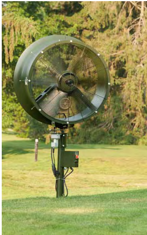
Figure 21. Fan used to cool low cut turfgrass surfaces.