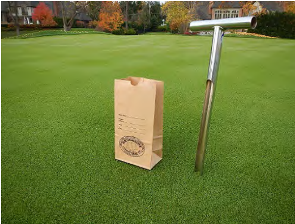
Figure 13. Collecting soil samples on a putting green.