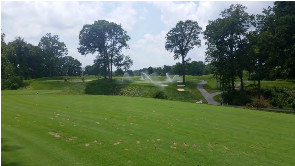
Figure 7. Green complex irrigation running on the Ackerman-Allen course at Purdue University.