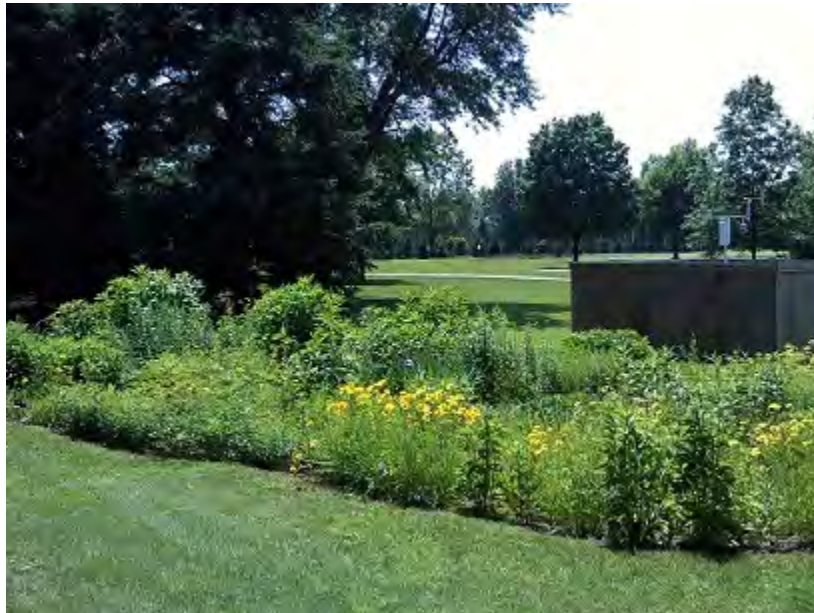
Figure 8. On-site weather station at Elcona Country Club.