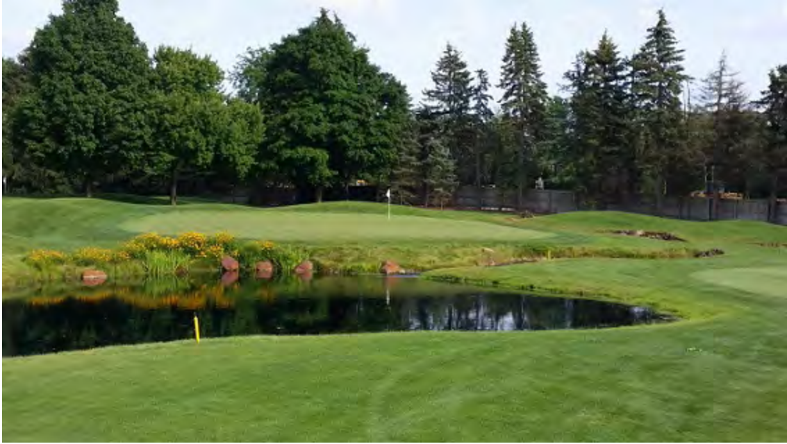
Figure 9. Pond at Elcona Country Club complete with 50% buffer “no maintenance” zone, pollinator plantings, and creek that serves as an aeration device.