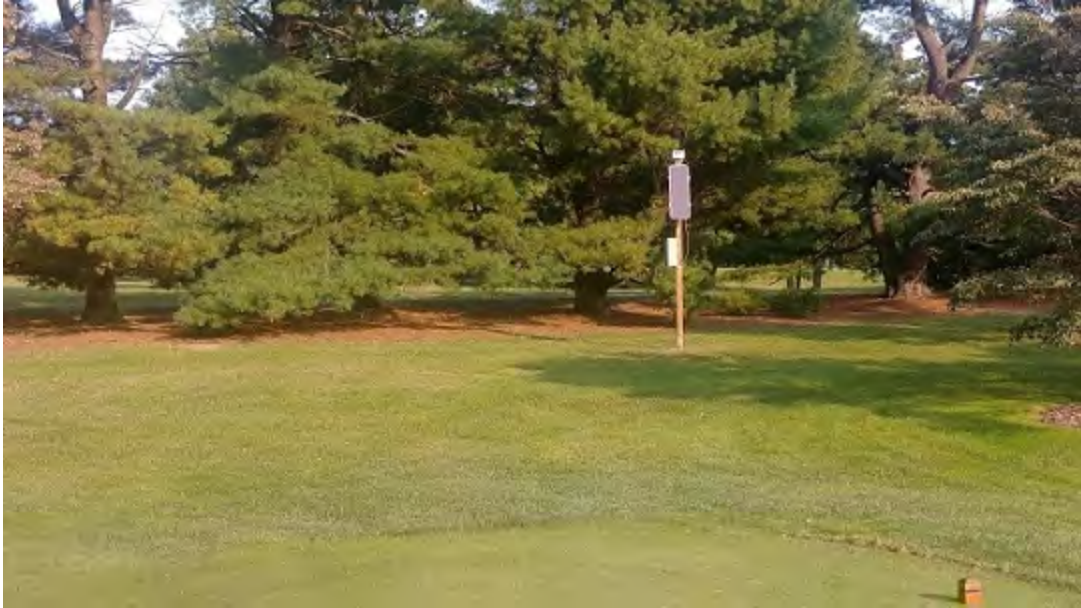
Figure 22. Use of solar panels to power a warning siren at Elcona Country Club.