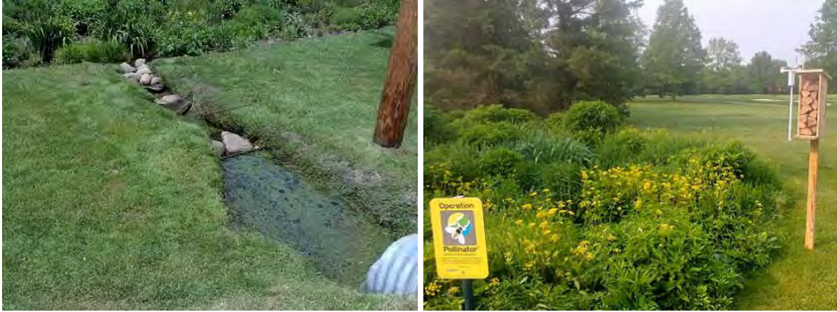
Figures 10 and 11. Vegetative rain garden at Elcona Country Club that traps and filters pollutants and clippings from equipment wash water sources.