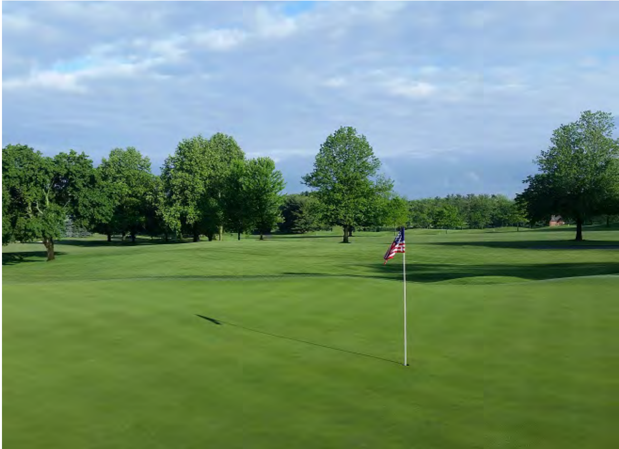
Figure 14. 18 Green at Elcona Country Club.